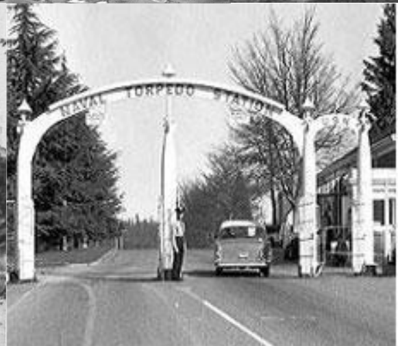
NUWC Keyport Main Gate 1962